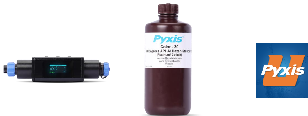
Figure 2 – MA-WB Bluetooth Adapter / COLOR-30 Calibration Std / uPyxis Desktop

https://upyxis.pyxis-lab.com.cn/release/pc/uPyxis.Setup-latest.zip